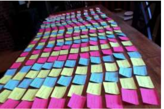
Favorite Bible verses are tagged in the Bibles we present to third graders on Children's Sunday.